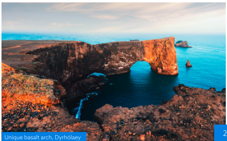
Unique basalt arch, Dyrhólaey