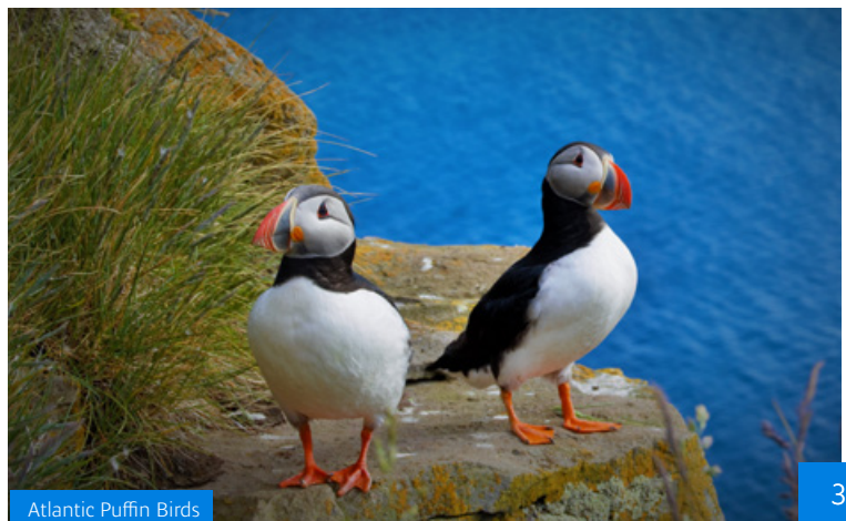
Atlantic Puffin Birds