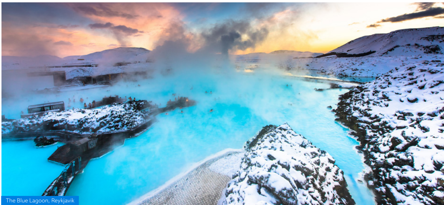
The Blue Lagoon, Reykjavik

Following a boxed or buffet breakfast, we check out and proceed to the airport for your flight back home (Standard check out is 1100 hrs). Good times never end. Hope to see you soon.