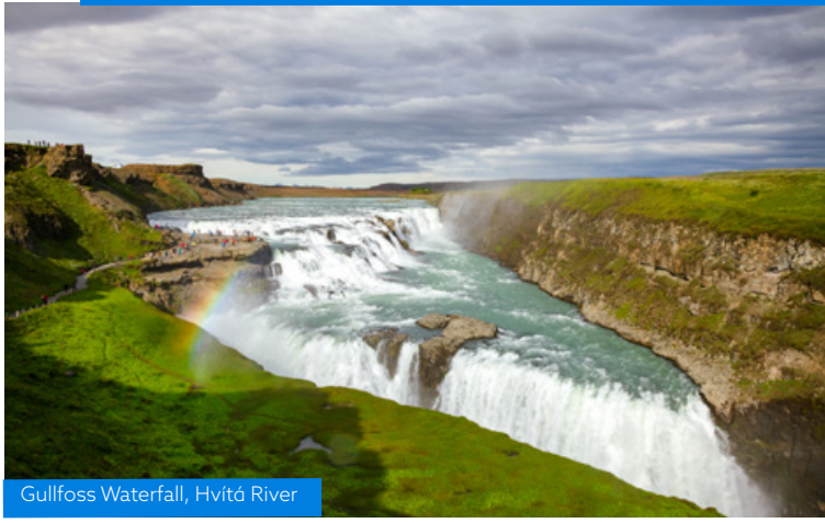
Gullfoss Waterfall, Hvítá River