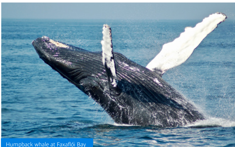
Humpback whale at Faxaflói Bay