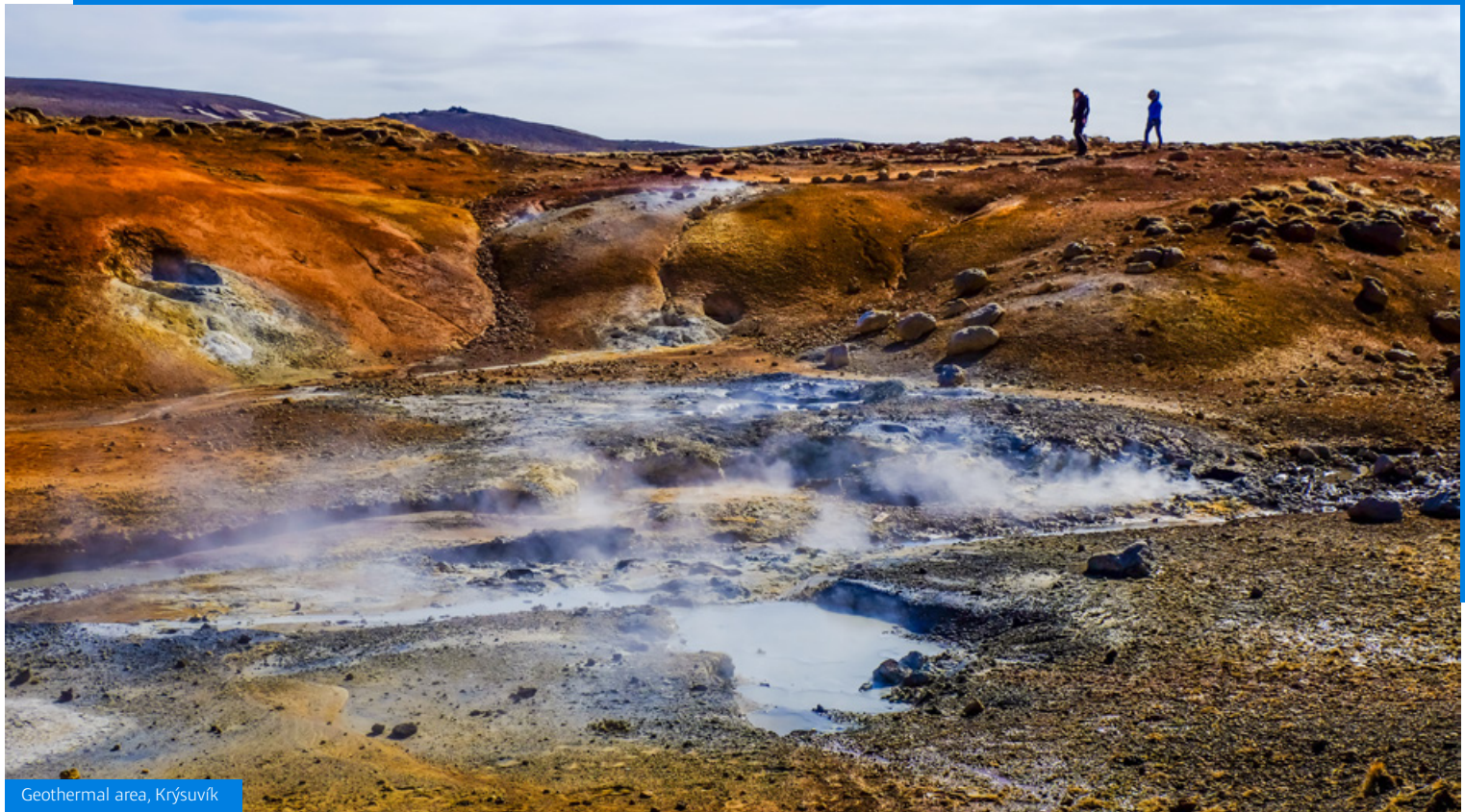
Geothermal area, Krýsuvík