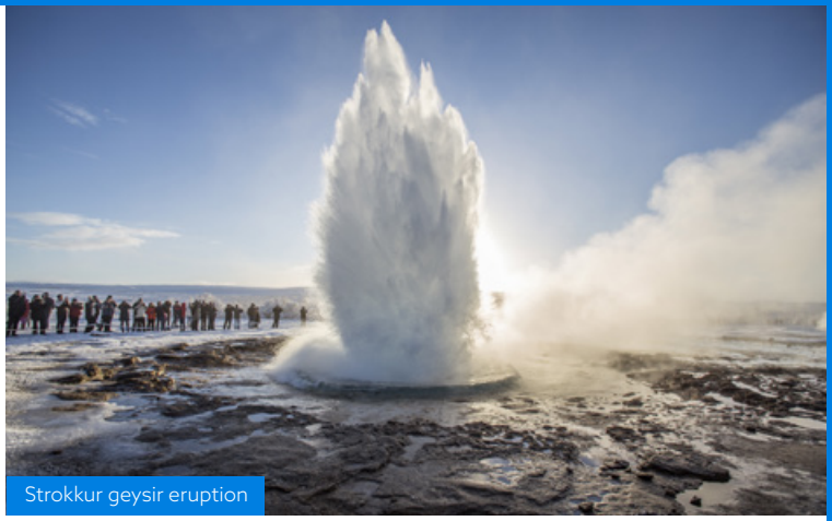
Strokkur geysir eruption